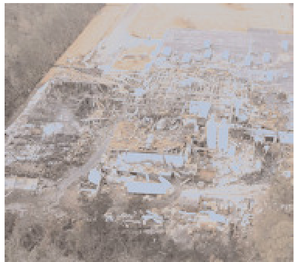
A pharmaceutical plant after a dust explosion.

An initial (primary) explosion in processing equipment or in an area where fugitive dust has accumulated may dislodge more accumulated dust into the air, or damage a containment system (such as a duct, vessel, or collector). As a result, if ignited, the additional dust dispersed into the air may cause one or more secondary explosions. These can be far more destructive than a primary explosion due to the increased quantity and concentration of dispersed combustible dust. Many deaths in past accidents, as well as other damage, have been caused by secondary explosions.